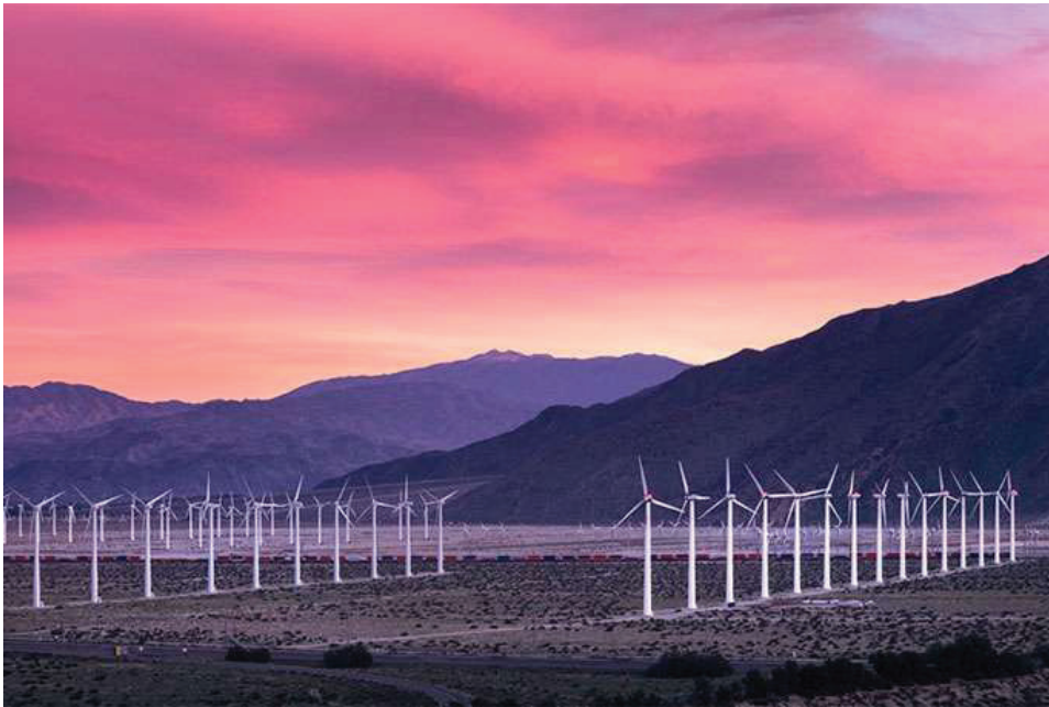
UC Berkeley researchers found that the proliferation of renewable energy plants — like the San Geronio Pass wind farm shown above — is responsible for over 90 percent of the direct benefit of California's climate and clean energy policies in the Inland Empire.